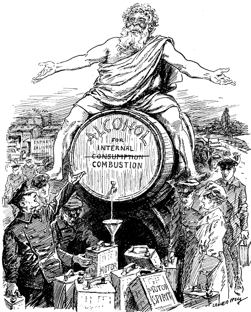
A CONVERTED SPIRIT.

ABV to ABW and mole fraction and vice versa